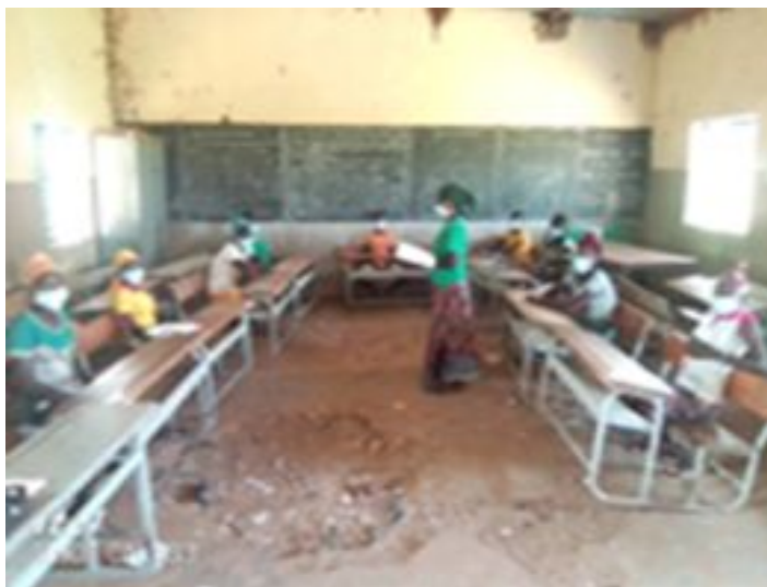
Animation of a safe space in Namouno while respecting the wearing of masks and social distancing.