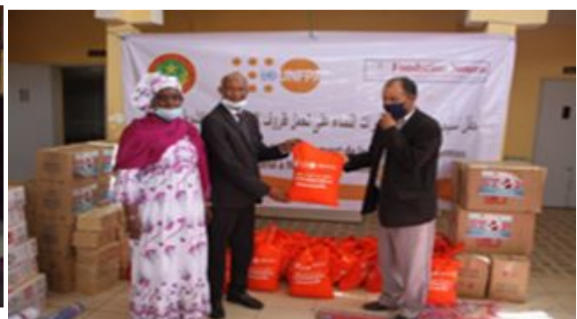
Official Donation Ceremony in the presence of the Gender Program Officer of UNFPA Mauritania.