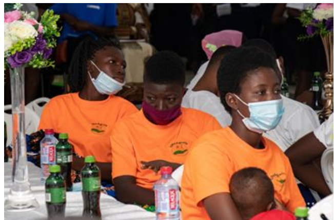
Life continues even after having a baby as an adolescent- The International Day of the Girl Child commemoration.