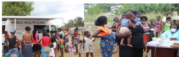
Service providers and Clients granted cover heads and masks to insure the continuity of provision of the RH, Family planning and Obstetric Care services.