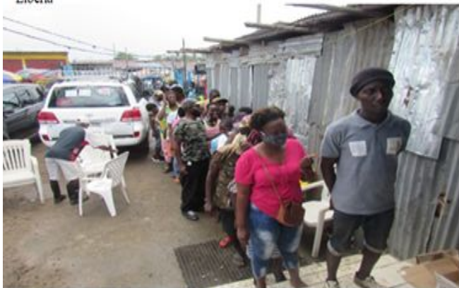
Disadvantaged youths awaiting service delivery during outreach activity in Gobe Chop Community, Red-Light