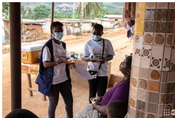
Young people engaging with the community during the door to door outreach on family planning.