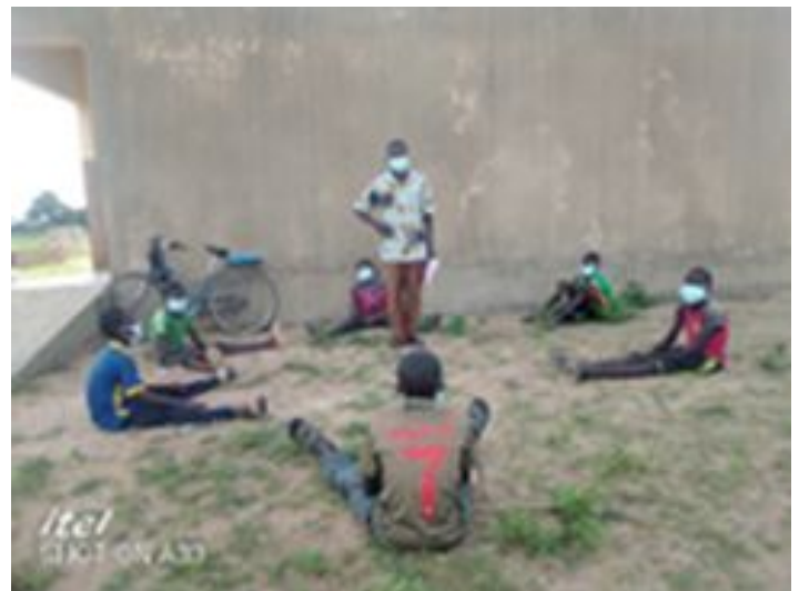
Animation of a club for future spouses in Kantchari with respect to the wearing of masks and social distancing.