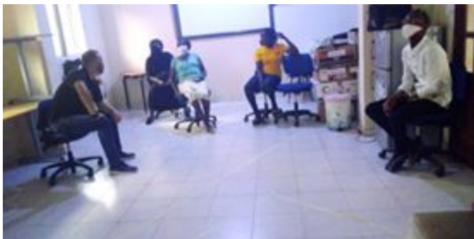
The trainer presenting the game themes to the participants.