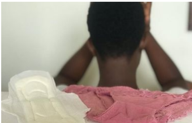
A young girl using a sanitary pad for the first time under the Because I want to Be Initiative.