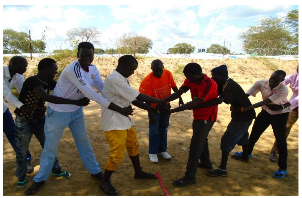
Youth participate in team building excercises during a UNFPA supported training in Bor.

Cumulatively, using selected core indicators, the status since 15 December 2013 is as summarized in Figure 2