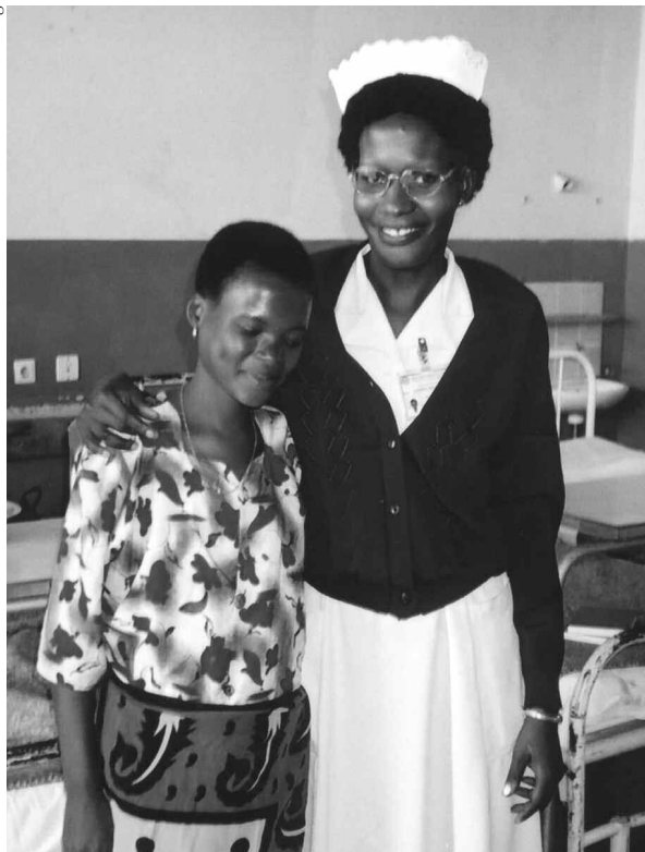
With adequate surgical staff and facilities, the great majority of fistulae can be successfully repaired or dramatically improved.