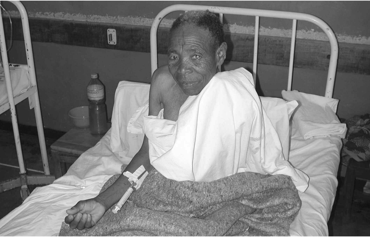
The head nurse at the project tells her staff, “Put yourself in your patients’ shoes and imagine how they’re feeling.”

row who gets fistula. Put yourself in their shoes and imagine how they’re feeling.” If a nurse feels uncomfortable on the ward, she can request a transfer, but the project staff try hard to work out such difficulties once a nurse has been trained. In the past year, only two nurses have rotated off the fistula ward.